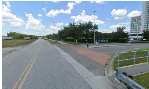
Tradeshow Boulevard looking south.

TRADESHOW BOULEVARD & KIRKMAN ROAD EXTENSION: Included as part of the International Drive Transit Feasibility and Alternative Technology Assessment (TFATA) was an evaluation of the potential to implement improvements to Tradeshow Boulevard, to include the addition of vehicular travel lanes and transit lanes between Destination Parkway and Universal Boulevard. Kirkman Road is under construction and extends south of Sand Lake Road and will end at the intersection of Tradeshow Boulevard and Universal Boulevard. The road was designed as a six-lane general use roadway with two dedicated transit lanes. The existing two-lane Tradeshow Boulevard will be over capacity once the Kirkman Road improvements are completed and the improvements are under design.